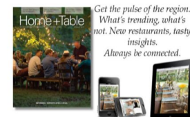
Home & Table Magazine

Click here to subscribe to our print or digital editions. It's that simple.