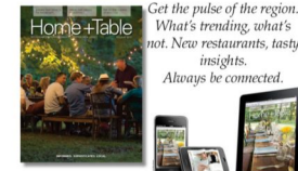
Alan Heckman Has Arrived - Home & Table Magazine